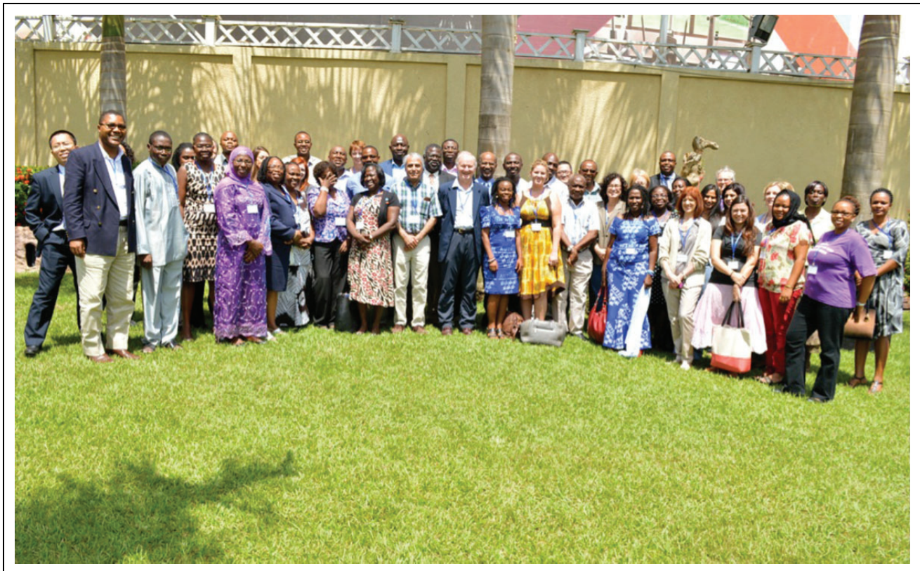
Figure 1. Portrait of delegates to autism in Africa meeting, Ghana, April 3-5, 2014.

disorder were invited to participate. Over 47 participants from 14 African countries attended (Figure 1, Table 1).